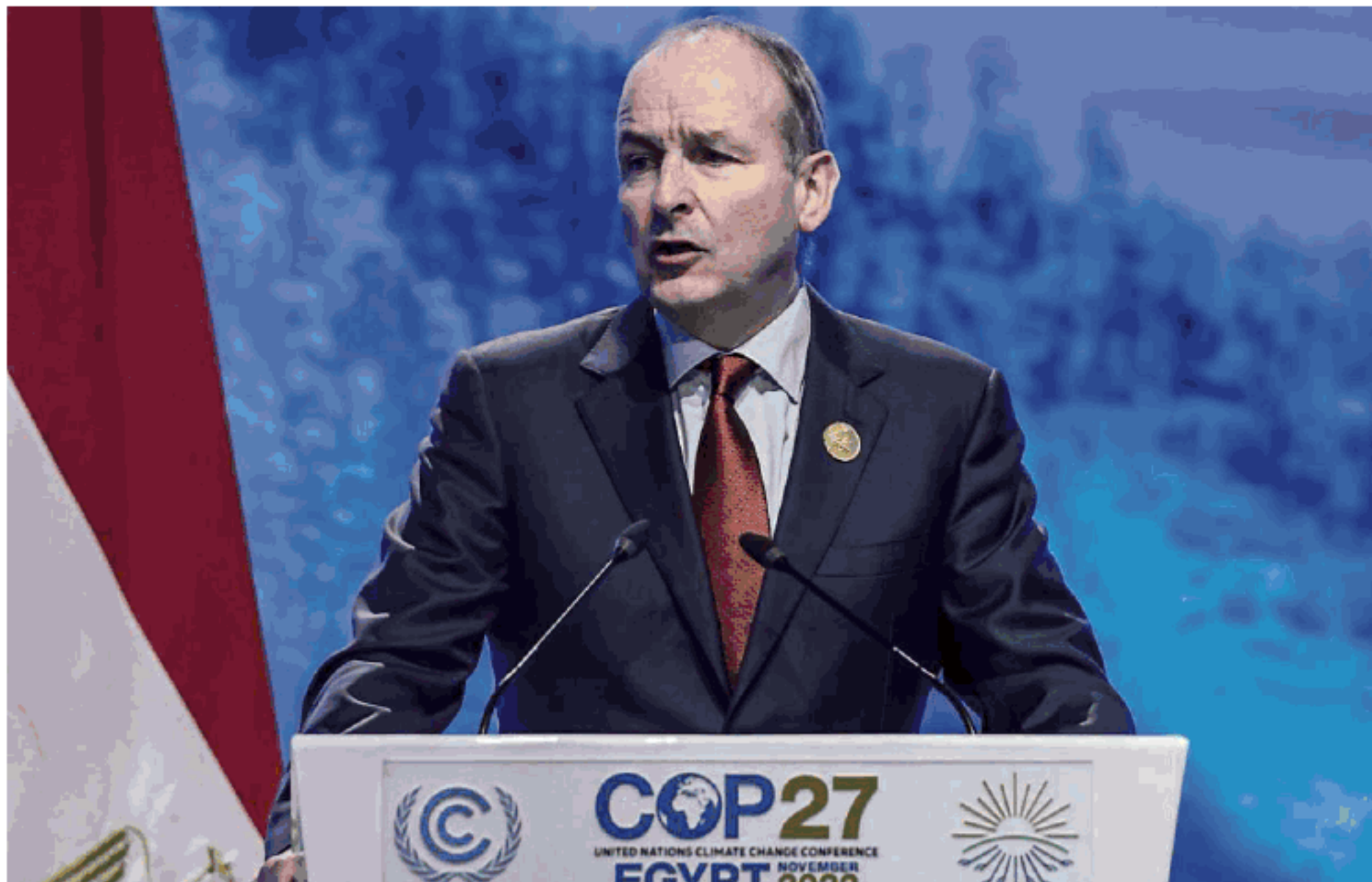
Taoiseach Micheál Martin delivering a speech at the leaders summit of the Cop27 climate conference at the Sharm el-Sheikh International Convention Centre in Egypt yesterday.