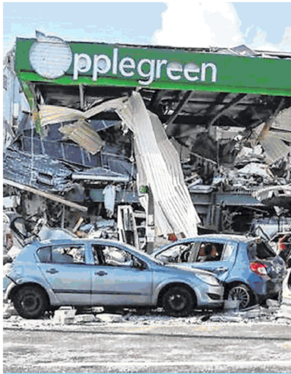
Tragedy: The aftermath of the explosion in Creeslough, Co Donegal, which killed 10 people last month